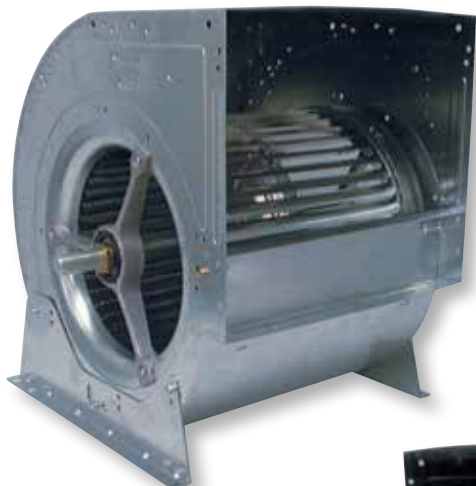
Constructive configuration of CBP-RC models